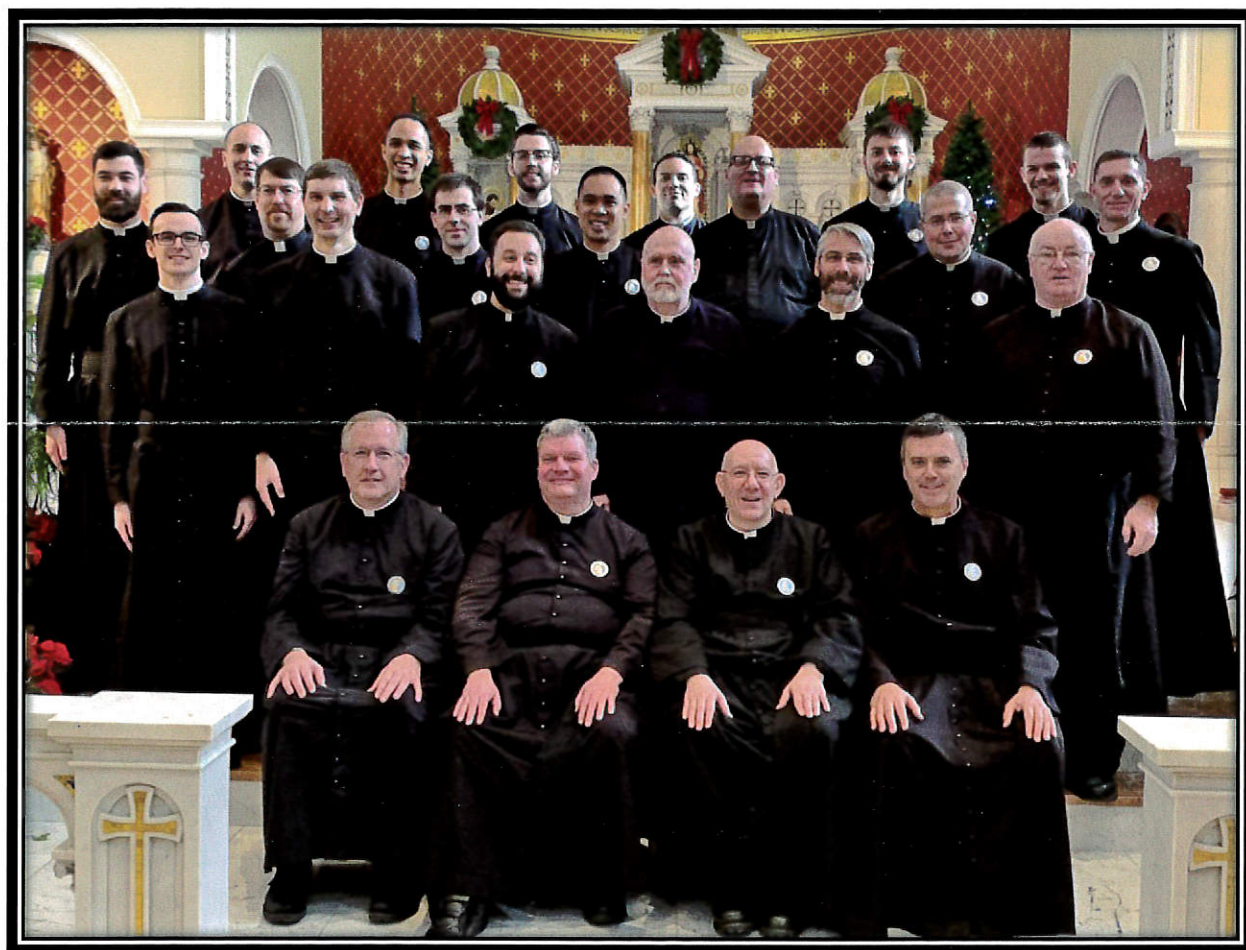
Priests, brothers and novices of Fathers of Mercy gathered for the Solemnity of Mary the Mother of God on January 1 st , 2020 in the Chapel of Divine Mercy, Auburn, KY.

A Happy New Year At The Fathers of Mercy!